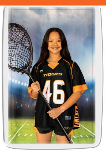
Acrylic keychain (L)